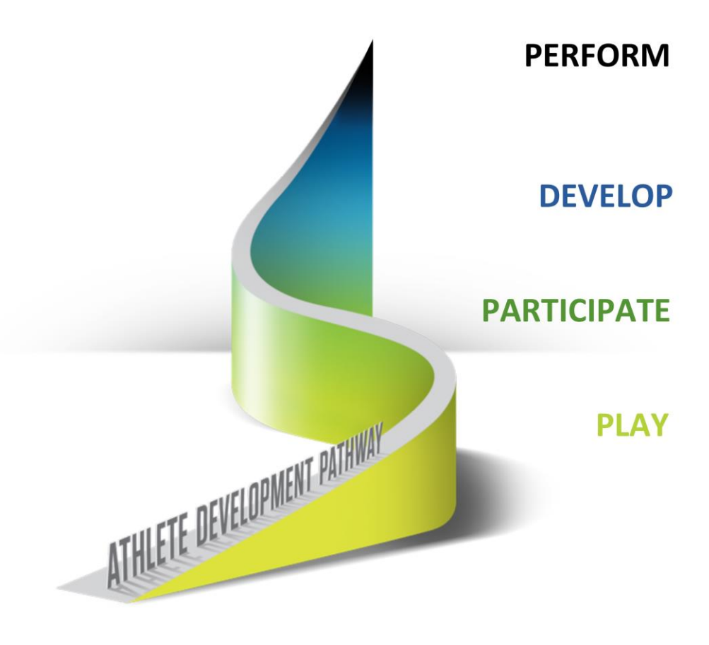
Figure 1: This visual captures a revised Sport NZ Athlete Development Pathway. More information regarding this visual will be provided to the sector in 2016/17.

The diagram below illustrates the Sport NZ athlete development pathway. It is a generic athlete development pathway, each athlete will follow their own path within competitive sport.